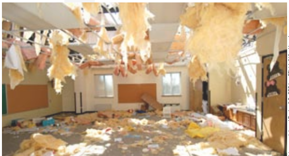
Marmaduke, AR, April 8, 2006

Learn how you can protect your students by developing an Emergency Operations Plan today!